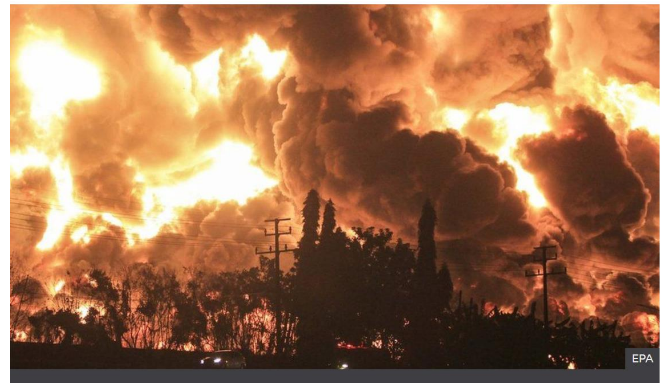
The massive fire broke out just after midnight on Monday