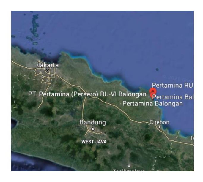
Estimated location Tankfires